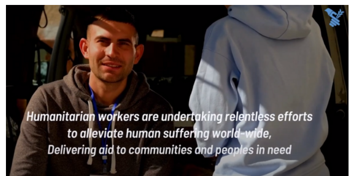
World Humanitarian Day (19 August)