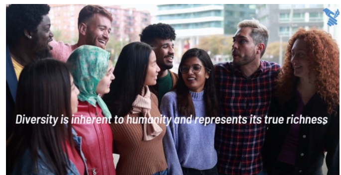
World Day for Cultural Diversity, Dialogue and Development (21 May)