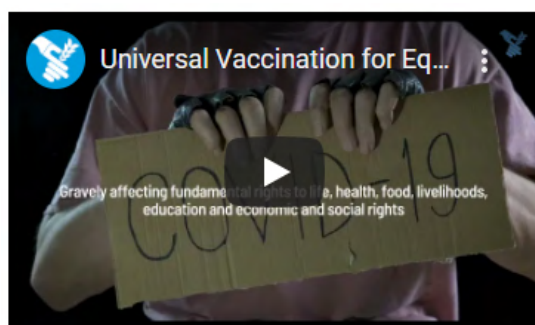
Universal Vaccination for Equal Human Rights 2021