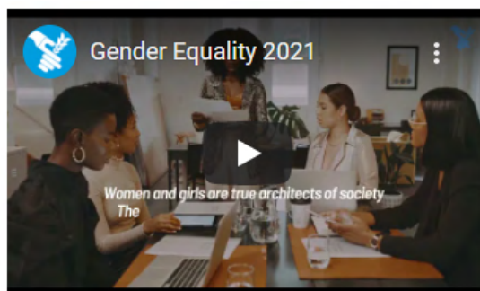
Gender Equality 2021

From January to December 2021, the Geneva Centre produced 29 videos related to human rights