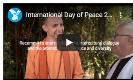
International Day of Peace 2021