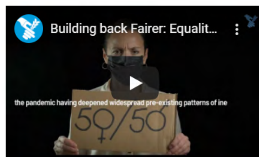
Building back Fairer: Equality in a Post-Covid World